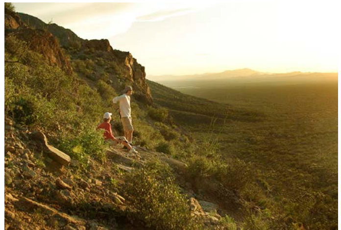
The whole family will enjoy the Arizona Guided Hike outing on Saturday, November 8. Plan to attend for an opportunity to enjoy the beautiful Tucson landscape and sunshine.

The beauty of the terrain and the ruggedness of the environment make a hike in the Tucson Mountains a unique and wonderful experience. This adventure will give you a real appreciation for the mesmerizing Arizona desert. The diversity of plants and wildlife that coexist in the Sonoran Desert, affirm the balance of nature. Your guide will share the flora and fauna and the incredible vistas. All plans are taken care of and we supply the necessary materials. Your only duty is to enjoy your visit with nature! The hike begins and ends at Starr Circle, located in the resort's main lobby. Tickets are $70 per person and includes professional guide, bottled water, sunscreen, snack, and gratuities. The hike is designed for the whole family with an easy to moderate difficulty level. Advance registration by October 14th is required. Subject to cancellation if registration is insufficient. Registrants will be notified in advance and refunds will be issued if this event is cancelled.