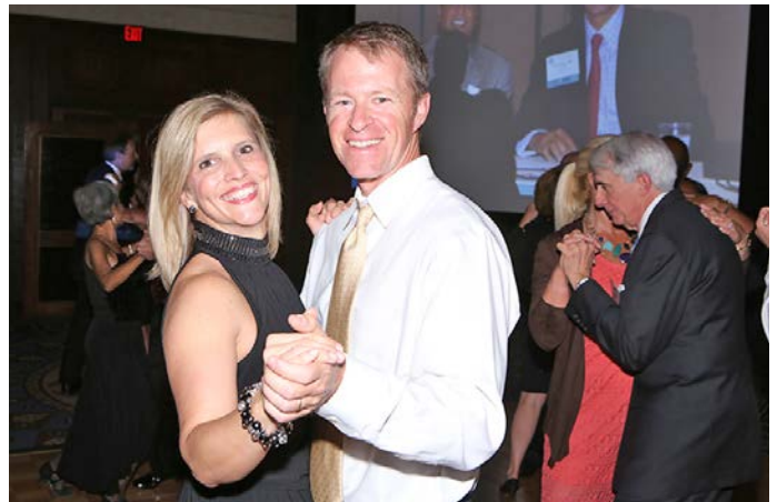
Plan to attend the STSA Awards Dinner & Dance for a fun evening of dinner and dancing with your fellow STSA members and friends.

We have a great band comprised of several STSA members and friends – that will play songs all night long. Award presentations will be shortened this year to maximize the time to socialize and enjoy your friends at the STSA. Although black tie is always in fashion, feel free to come in your own costume (Superhero, Superwoman, Superman, Renaissance, Gatsby, etc., nothing is off limits) to compete for the best-, most originally- or most outlandishly-dressed. And if your idea of black tie is more casual, that will be fine as well. The important thing is to be comfortable and have fun. It will be the perfect finale to a great meeting.