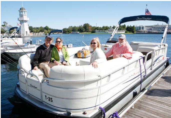
Join the Fishing Tournament on Saturday, November 7 at 1:30 pm.

Enjoy a two-hour guided catch-and-release fishing excursion on the waterways of the Walt Disney World Resort ®. Tickets are $55 and include non-alcoholic beverages, fishing poles, bait, tackle, and guide. Advance registration by October 13 is required. Subject to cancellation if registration is insufficient. Registrants will be notified in advance and refunds will be issued if this event is cancelled.