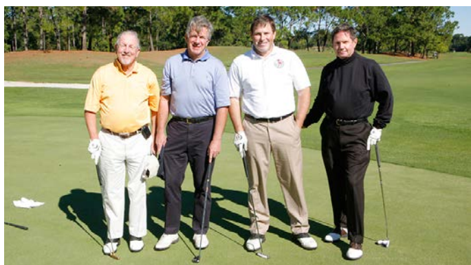
Join the Golf Tournament on Saturday, November 7 at 12:45 pm.