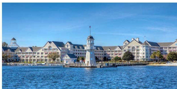
Disney's Yacht Club Resort is the perfect destination for an STSA Annual Meeting – bring the entire family!

Renovated extensively in 2013 by Arnold Palmer Design Company, Disney's Golf Course is considered one of the most naturally beautiful courses in the country by professionals and amateurs alike. The course features strategically-placed palms, 59 bunkers, and many sparkling lakes and waterways; the natural Florida woodlands provide a stunning backdrop to one of America's premier resort courses.