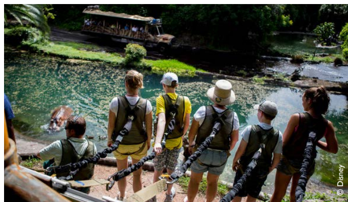
Join the Wild Africa Trek on Saturday, November 7 at 1:15 pm.

The Wild Africa Trek is an immersive experience at Disney's Animal Kingdom® Theme Park that gives guests a unique opportunity to enjoy unexplored areas of the Harambe Reserve. This three-hour experience led by specially-trained guides begins in the Safi River valley where expedition harnesses will allow Guests to cross precarious rope bridges and enjoy close-up views of Nile hippos and crocodiles. The journey continues along the edge of a magnificent, wide-open African savannah, where Guests board a specialized vehicle to enjoy an exclusive safari, including a stop at a private safari camp for premium animal viewing and African-inspired food samplings. Tickets are $240 per person and include transportation, a souvenir water bottle, and photos. Children must be accompanied by a paying adult and must be at least 8 years-old. Minimum height is 48 inches, minimum weight