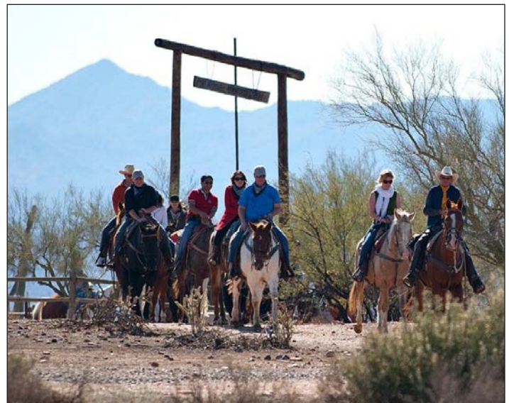
Explore the desert on horseback Saturday, Nov. 2 from 1:00 p.m.-5:00 p.m. Advance registration by Oct. 7 is required.

Explore the desert on horseback for a fun adventure and glimpse of Arizona's unique landscape on Saturday, Nov. 2. Participants will ride through tranquil canyons, traverse riverbeds, and criss-cross mountain trails. Attendees should wear close-toed shoes, jeans or long pants, hat, sunglasses, and sunscreen. This activity is designed for the whole family, but it is not recommended for expectant mothers or individuals with serious health problems. Tickets are $170 and include transportation, a professional guide, bottled water, helmet, and gratuities.