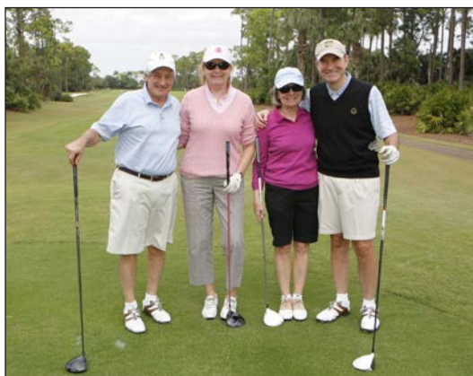
Join the Golf Tournament on Saturday, Nov. 2. Tee times are available beginning at 12:30 p.m. Advance registration by Oct. 7 is recommended.

The 2013 Golf Tournament will take place at the Gainey Ranch Golf Club, right on the resort property. Play one of the preeminent golf courses in the country, surrounded by incredible scenery. The cost to participate in the tournament is $240 and includes greens fees, baggage handling, shared golf cart, and a boxed lunch. A limited number of tee times is available, so be sure to register in advance. If you wish to rent clubs, please call the hotel's golf department at 480.444.1234 ext. 5700 (club rentals fees are not included in the above cost).