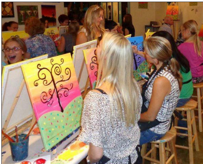
The Brush Bar outing will take place on Friday, Nov. 1 from 1:15 p.m.-5:15 p.m. Advance registration by Oct. 7 is required.

This activity is perfect for both aspiring artists and those seeking a fun, interactive experience. In a relaxed, social setting, a professional instructor will guide attendees through replicating a featured painting step-by-step. This outing will take place on Friday, Nov. 1 from 1:15 p.m.-5:15 p.m. Tickets are $150 and include transportation, painting materials, first beverage, and gratuities. Attendees should be at least ten-years-old and clothing to paint in is the suggested attire. Aprons will be provided.