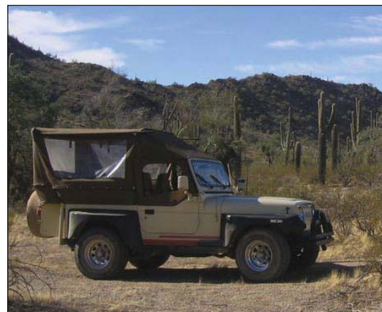
Tour the desert with the whole family in a 4x4 jeep with professional guide and driver on Saturday, Nov. 2 from 1:00 p.m.-5:00 p.m. Advance registration by Oct. 7 is required.

Tour the Sonoran Desert on Saturday, Nov. 2 in a 4x4 jeep during an outing that the entire family will enjoy. Cruise along dirt roads, spotting birds, cacti, and other wildlife along the way, and listening as your guide explains the history, folklore, and geology of the area. Suggested attire includes closed-toe shoes, jeans or long pants, hat, sunglasses, and sunscreen. This activity is not recommended for expectant mothers, individuals with serious health problems, and infant/toddler-aged children. The $150 ticket includes transportation, professional guide/driver, bottled water, and gratuities.