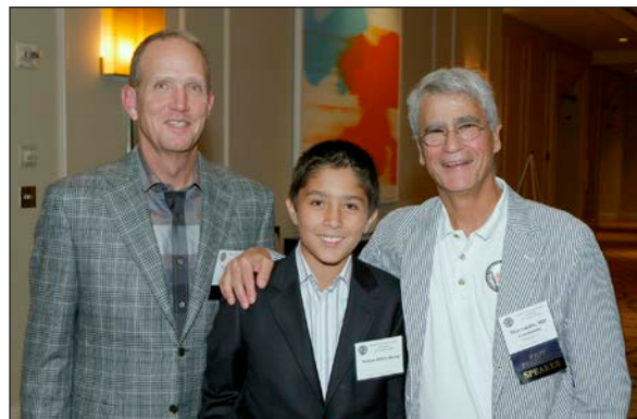
Bring your family to the Annual Awards Dinner & Dance on Saturday, Nov. 2 beginning at 7:00 p.m. Advance registration by Oct. 7 is recommended.

Conclude your STSA 60th Annual Meeting experience with the always-memorable Annual Awards Dinner & Dance. Advanced registration is recommended, and a limited number of tickets will be sold on site. The Awards Dinner & Dance is family-oriented this year. Children are invited to come and eat with their parents ($35 tickets are available for kids under the age of 12 and include a chicken finger dinner). Tuxedos for men and formal gowns for women are encouraged, keeping with tradition, but not necessary. The dress code is optional and varied and can range from formal to business casual (tuxedo, jacket and tie, or just a sports coat for men and from evening gowns to cocktail dresses and a blouse with slacks or a skirt for women). Since the meeting falls on Halloween this year, children and parents may also wear costumes. The whole family can dress up in a theme if desired, or just the kids.