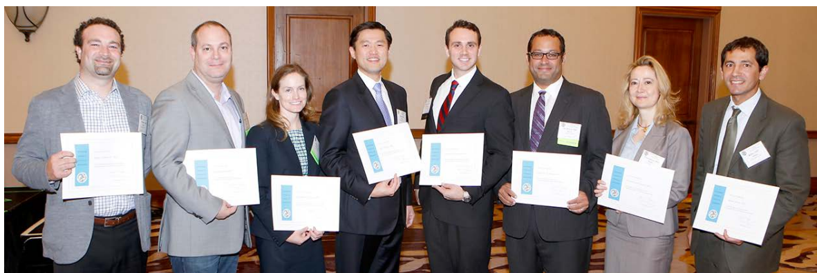
STSA welcomed 60 new members at the November 7, 2014 Annual Business Meeting in Tucson, AZ.

Congratulations and welcome to the following cardiothoracic surgeons, residents, interdisciplinary care providers, and medical students approved for STSA Membership during the Annual Business Meeting held November 7, 2014 in Tucson, AZ.