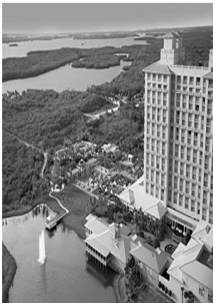
Delight in the stunning views the Hyatt Regency Coconut Point in Bonita Springs, FL affords guests.

Be sure to check in regularly with our Web site at www.stsa.org for continuing updates on our 50th Anniversary Meeting.