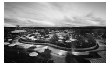
A twilight view of the resort's pool, waterslide, and lazy river situated in the beautiful Texas Hill Country.

The STSA 58th Annual Meeting will be held November 9 – 12, 2011 at the newly opened JW Marriott San Antonio Hill Country Resort. With an outstanding lineup of educational and social activities, you won't want to miss this opportunity to experience STSA in Texas! Located just 12 miles from San Antonio International Airport, the resort provides the ultimate get-away with activities for everyone. Featuring an impressive water park and a relaxing lazy river, 36-hole professional golf course, fully outfitted spa, and seven on-site restaurants and lounges, this destination is sure to please everyone in your family! Nature lovers have plenty to explore on the property's 600 acres of rolling, oak tree-covered hills with an adjacent bird sanctuary, and downtown San Antonio attractions are only twenty minutes away. The peaceful, luxurious atmosphere at the JW Marriott San Antonio Hill Country Resort & Spa creates the perfect backdrop to relax and enjoy Southern Texas. Make plans now to attend with your whole family!