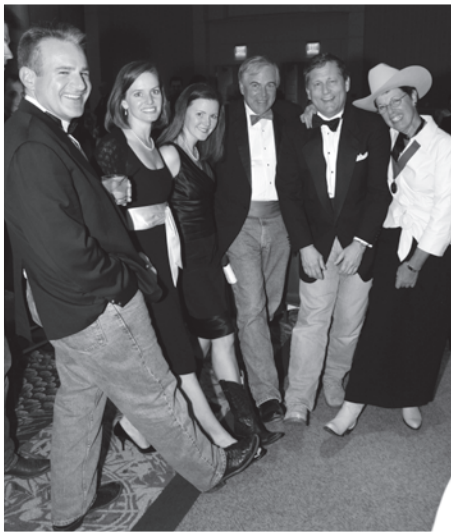
STSA Members at the 2008 Texas Tuxedo Dinner in Austin, Texas.

The Saturday Night Awards Dinner has been a tradition at STSA Annual Meetings for many years. At this year's meeting in San Antonio, the Saturday night event is goin' Texan!