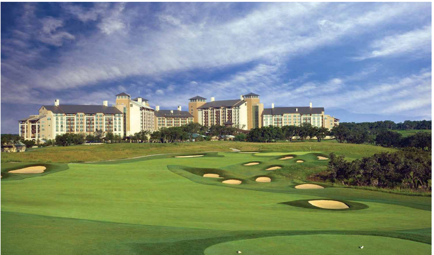
A view of the golf course overlooking the hotel at the JW Marriott San Antonio Hill Country Resort & Spa.

The Advance Program, registration, and housing information will be available at www.stsa.org this summer.