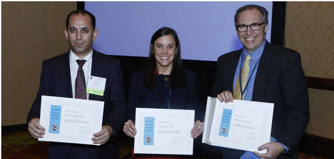
STSA welcomed new members at the November 10, 2017 Annual Business Meeting in San Antonio, TX.

Congratulations and welcome to the following cardiothoracic surgeons, residents, interdisciplinary care providers, and medical students approved for STSA Membership during the Annual Business Meeting held November 10, 2017 in San Antonio, TX