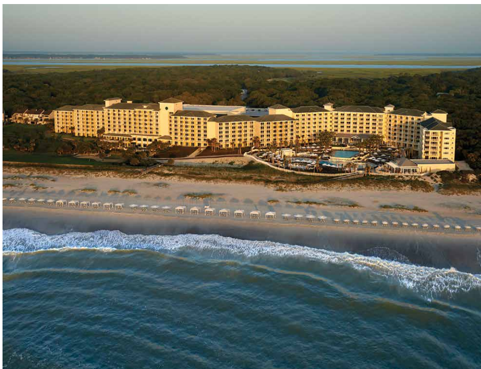
Attend the STSA 65th Annual Meeting and enjoy the beautiful Omni Amelia Island Plantation Resort.

STSA President, Dr. Kevin Accola, and staff traveled to Amelia Island in March to conduct a site visit and found the Omni Amelia Island Plantation Resort to be an ideal location for STSA members, friends, and families. The luxury resort is nestled on 1,350 acres at the top of a barrier island just off the Northeast Florida coast. Unparalleled views of the Atlantic Ocean and spacious accommodations are available in every room. The multi-tiered pool deck features an adults-only infinity edge pool, a 10,000-square-foot family-friendly pool, Splash Park water playground, and supervised activities. The hotel offers 36 holes of championship golf, and a variety of relaxing and rejuvenating treatments in their beautiful spa.