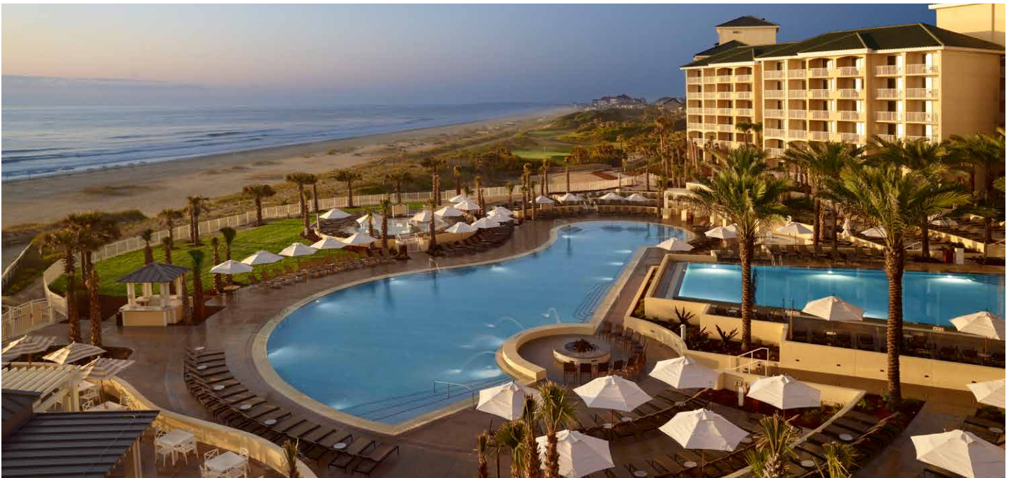
The Omni Amelia Island Plantation Resort offers luxurious oceanfront accommodations and countless activities.

Join fellow meeting attendees and their families for the always-memorable Dinner Gala, complete with a cocktail reception, dinner, awards and musical entertainment. A local band has been added to this year's program and will provide easy listening during dinner. Although black tie is always in fashion, you are welcome to wear cocktail attire. Be comfortable and have fun!