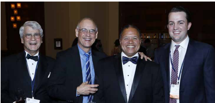
STSA members enjoy the Dinner Gala at the 2017 STSA Annual Meeting.