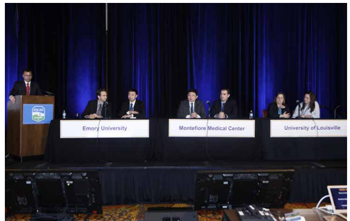
Cardiothoracic surgery residents compete in the STS Jeopardy competition at the 2017 STSA Annual Meeting.

This cognitive skills competition draws a large crowd. Come watch cardiothoracic surgery residents test their knowledge!