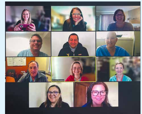
The 2021 STSA Program Committee met virtually to review abstract submissions in preparation for the STSA 68th Annual Meeting.

E-posters and scientific videos are back! STSA will offer a digital library of the abstracts selected to be displayed at the annual meeting in the form of a scientific poster or video. Screens will be available on Thursday and Friday in a large foyer area of the meeting space, and will be separated for safe, social distancing while viewing. Although CME will not be offered in conjunction with these abstracts, it's an opportunity to engage with fellow surgeons in an informal, safe, and social environment.